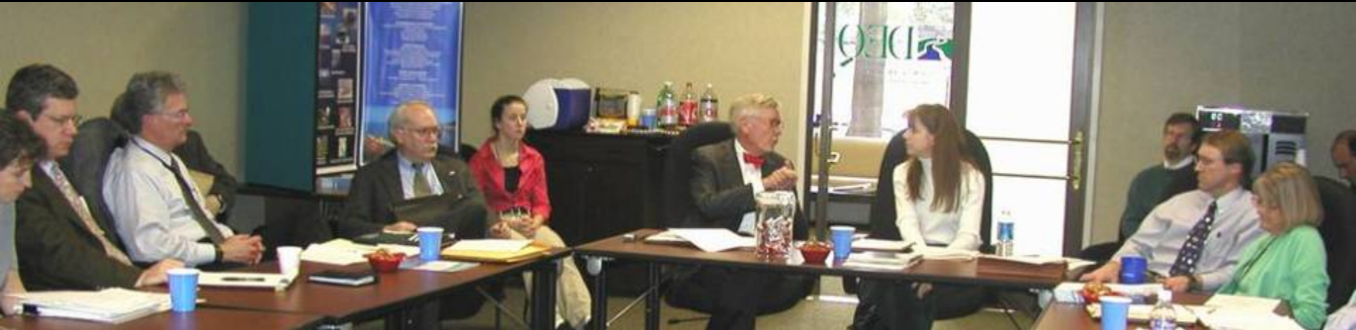
30 Member Interagency Coastal Policy Team